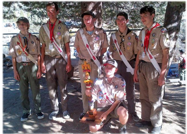
W4N Conclave Spirit Stick returns to Topa Topa!